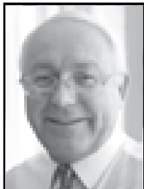
Sir Philip Cohen

Professor Sir Philip Cohen is the founder and Co-Director of the Division of Signal Transduction Therapy (DSTT), the UK's largest collaboration between a basic research institution and the pharmaceutical industry. It is widely regarded as a model for how industry and academia should interact, for which it received a Queen's Anniversary Award for Higher Education in 2006.