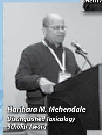
Harihara M. Mehendale Distinguished Toxicology Scholar Award