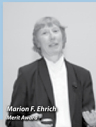
Marion F. Ehrich Merit Award