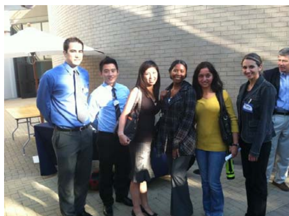
Some of our Student members at fall meeting