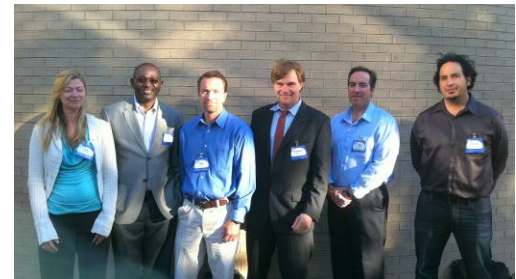
Some Council Executive Members