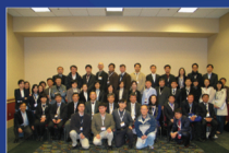
2010—Salt Lake City Group Picture