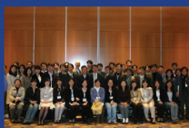
2008—Seattle Group Picture