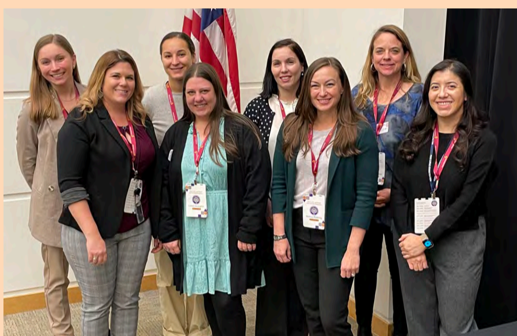
NCAC EC Board 2023