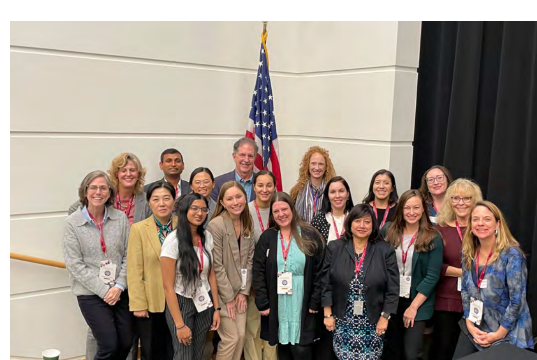
Chairs & attendees