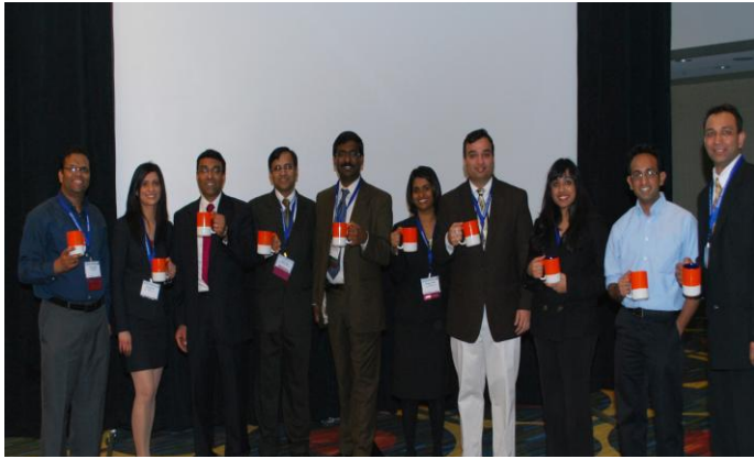
'The Reception Team' with ASIO signature mugs