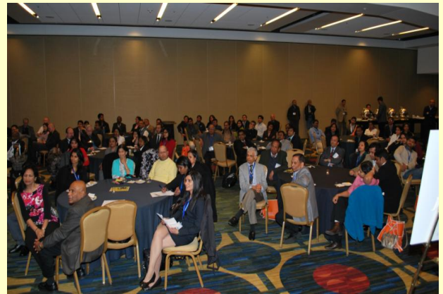
Huge response to the ASIO-SOT 2012 reception