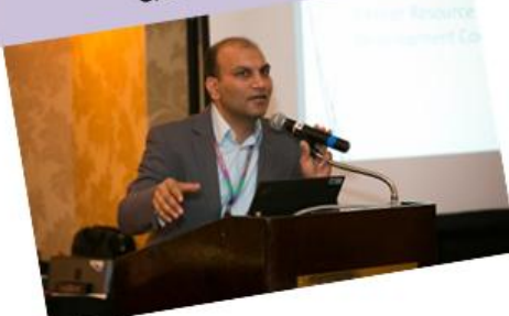
*Learn about activities