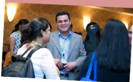
*Meet new students