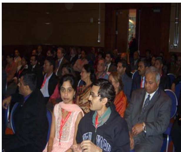
Attendees at the Reception and Dinner.