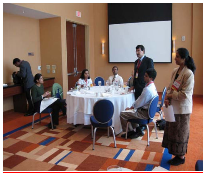
Mentors and Participants at the Lunch N 'Learn Session