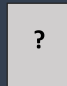
(THIS CAN BE YOU!) Graduate Student Representative