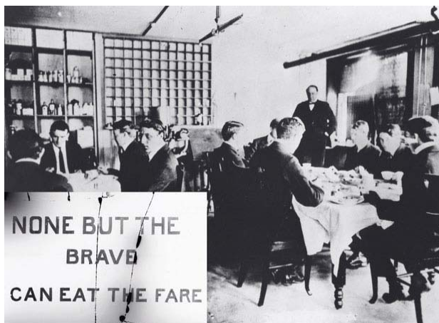
Under the authority of the U.S. government, Harvey Wiley, upper right, presided over a team of borax-eating men known as the Poison Squad.